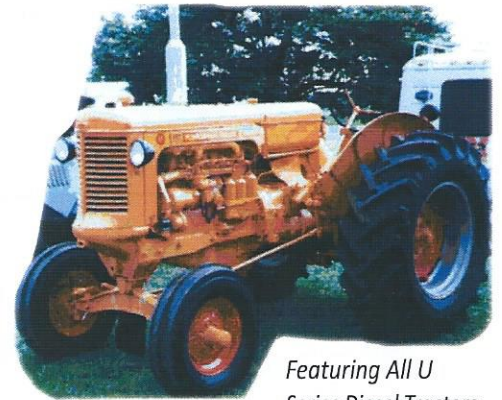
Featuring All U Series Diesel Tractors