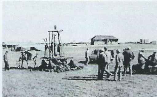
Pre- 1900's Encampments Selling period items Trappers, Traders, Ect...